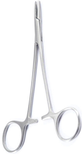
Halsey Needle Holder