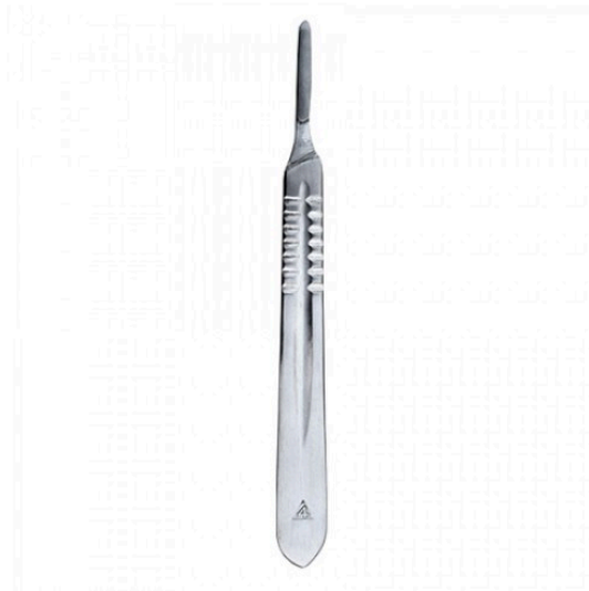
Bp Handle SI-127-103-1