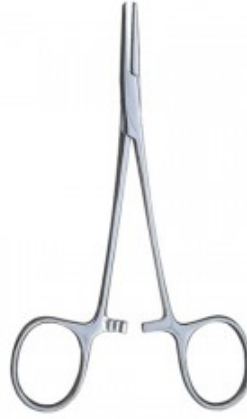
Halstead Mosquito SI-212-102