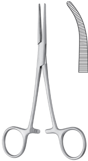
Crile Hemostatic Forceps