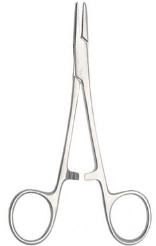
Wrights Needle Holder