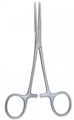
Pochester Pean SI-212-106