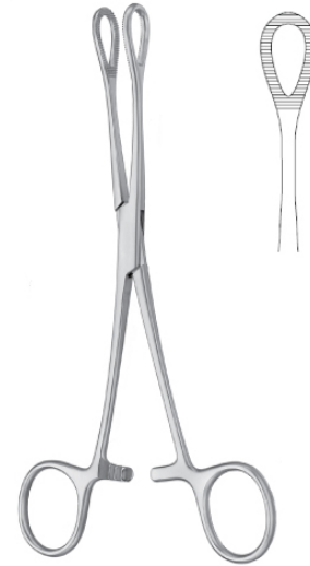
Foerster Sponge Forceps

Crile hemostatic forceps curved 14cm Disposable, sterile single use