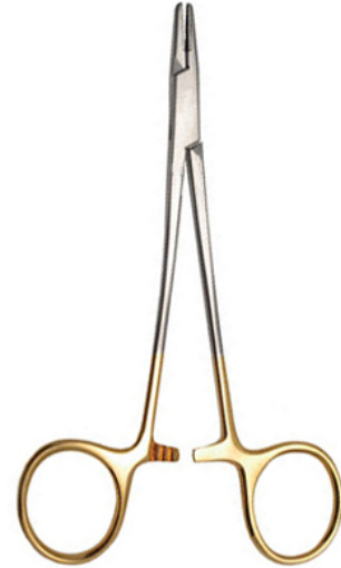
Neivert Needle Holder